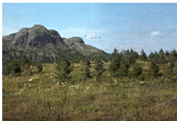
Corsican pine, Calabrian pine, Scots pine, Austrian pine and Japanese larch