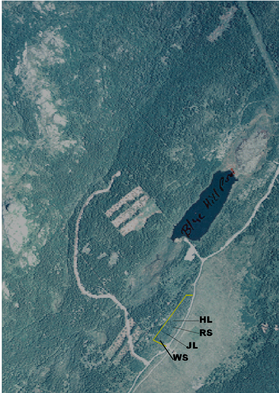
1995 aerial photo showing considerably more forest cover (some of it strip cut) west and north of Dock Ridge Road. The 30 year-old plantation beside Dock Ridge Road is easily seen, particularly the plots of white spruce (WS), Japanese larch (JL), red spruce (RS) and hybrid larch (HL), respectively.

The 1995 aerial photo shows a considerable expansion of forest cover west of Dock Ridge Road, much of it mature enough to be strip-cut.