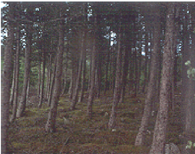
Bole sweep of Japanese larch due to brisk, persistent westerly wind.

The hybrid larch plot is partially sheltered by the red spruce plot on the windward side. Hence, the sweep of boles is less pronounced than in Japanese larch. The hybrid larch plot is also sheltered on the north flank by natural woodland and, therefore, wind throw is minimal.