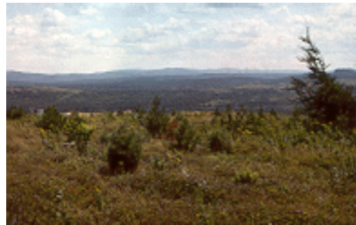
10 yr old Corsican and Calabrian pine on Dock Ridge Road. The severe flagging of a much older, naturally regenerated tamarack is an obvious indication that the trees are subjected to brisk, persistent southwest wind

Further upwind, the sweep in the boles of European larch is negligible because of the shelter provided by the dense red spruce plot.