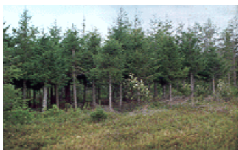
30 year-old red spruce plot that was brashed when it was 29 years old. Barely visible at the far right and behind the red spruce are the sickly crowns of European larch.

Survival of the three varieties of Austrian pine (Corsican, Calabrian and Austrian) is spotty at