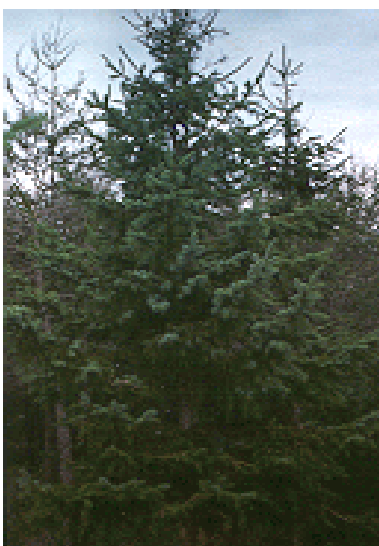
A fine specimen of one of the few surviving 30-year-old Hondo spruce.

European larch thrives best in fairly open stands on sheltered sites with deep, well-drained and relatively warm soils. At best, the European larch is on moderately fertile, but shallow brown soils. It is partially sheltered from persistent south west and gale-force northwest winds by dense stands of exotic and native tree species. However, the stand has become too dense to allow for adequate levels of solar radiation to warm up the soil.