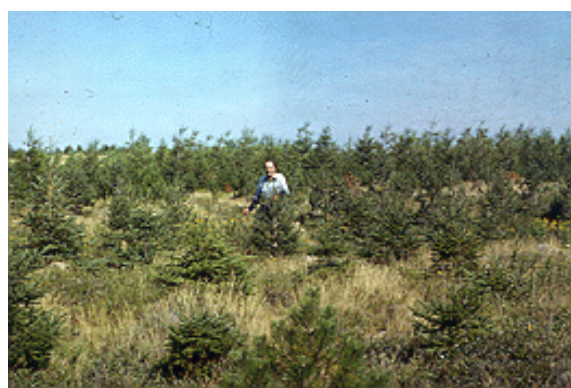
Front-back: Red spruce, Scots pine and Japanese larch