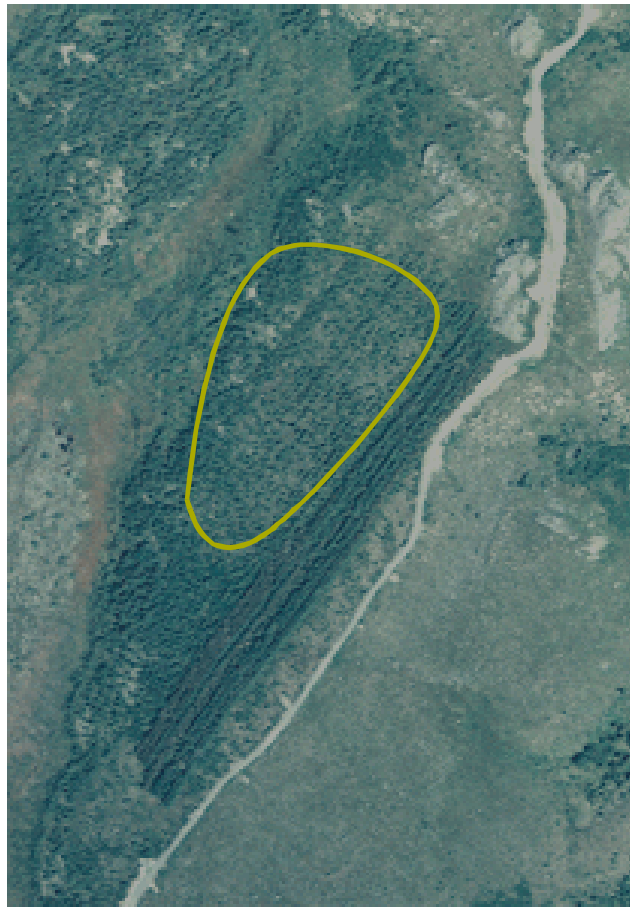
Lee's Pond plantation off the Avondale Access road. The poor survival and growth of planted stock in the centre of the plantation suggests there is a perennial high water table which favour natural regeneration of tamarack.