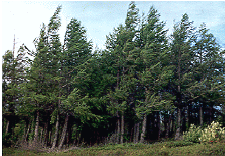
The same stand at 30 years of age. Top height is 10-12 m, and dbh 16 cm. The stand was lightly thinned in 1998.