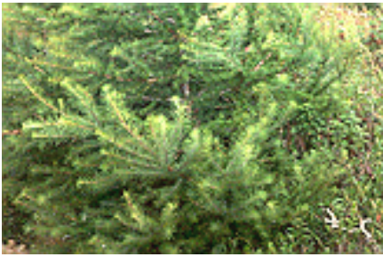
Branch of Japanese larch

Natural hybridization between larch is not unusual - the renowned Hørsholm Arboretum near Copenhagen in Denmark, has at least a dozen hybrid larches. But perhaps the most famous hybrid larch is the Dunkeld larch (a cross between European and Japanese Larch) that was discovered as a seedling in a nursery bed of two-year-old European larch. It turned out that the Dunkeld hybrid was superior in growth and yield and adaptability to a wider range of sites than either of its parents.