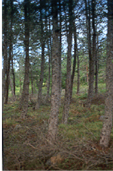
30 year-old Japanese larch stand on Dock Ridge Road. Average height is 12 m and dbh 17 cm. In 1998 it was thinned to about 2,000 stems \text{ha}^{-1} .

It has been speculated that die back results from late spring frosts. This seems unlikely. First of all, the persistent windiness of weather on the ridge is the opposite of a frost hollow. So, with adequate air circulation, late spring frost is not likely to be frequent: even if it was, larch readily recovers from minor bouts of frost. A more likely explanation is that larch, being a light demander, prefers open-growing conditions. Or, more to the point, relatively warm soils. Therefore it is necessary to thin early to increase the solar radiation receipt to ensure greater heat penetration into the soil earlier and for a longer period.