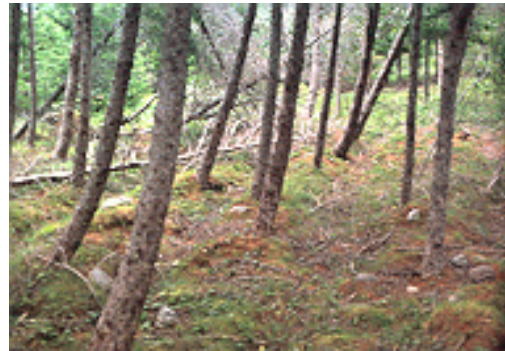
Endemic wind throw on the northern flank of the Japanese larch plantation due to up-slope wind.

Violent gusts have caused a blow out on the northern flank of the Japanese larch stand is not yet protected by natural stands of balsam fir and black spruce. The fact that, ploughing induces shallow rooting confined mostly along the turf reduces wind-firmness.