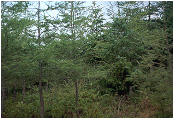
Part of Lee's Pond plantation, which was ploughed in 1966, planted in 1967 and replanted between 1968-70. Both tamarack (left) and one of the few surviving Hondo spruce (right) have gotten off to a slow start; but showing signs of much better growth over the past few years. Note also, vigorous natural regeneration of tamarack in the understorey.

On the positive side, the furrows have encouraged vigorous natural regeneration of tamarack. That is until shrubs began dominating the understorey within the last decade or so. Along the margins of the plantation, particularly on the east side, which has a high proportion of grasses, natural regeneration of tamarack is exceptionally good. In fact, on the abandoned blueberry farms, along the Avondale access road, there is generally a higher than normal proportion of young tamarack.