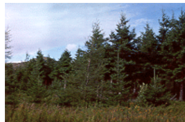
A fine stand of 30 year-old planted white spruce (right) with vigorous natural regeneration of spruce, tamarack and balsam fir.