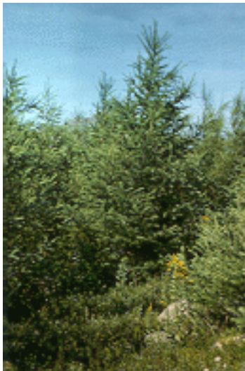
10 yr old hybrid (erroneously called European larch) larch on Dock Ridge Road. Average height is about 5 m and survival 90% or better.