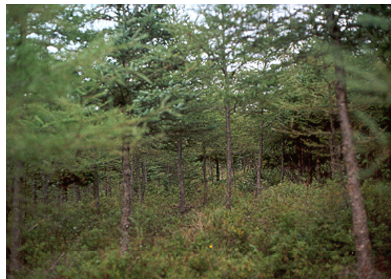
Part of Lee's Pond plantation showing mediocre growth of planted tamarack and one of the few surviving white spruce (left of centre). In contrast to the adjacent photo a dense understorey of shrubs is effectively restricting natural regeneration of tamarack

Among the tamarack, there are a few Sitka and Hondo spruces which are only now beginning to show signs of good growth. The best part of the plantation is a mixture of Scots pine, Jack pine, tamarack and black spruce, and a few white spruce. The top height of tamarack is 10-12 m and dbh in the range of 14-19 cm. In terms of growth and yield, there is not much difference between Scots pine and Jack pine - their top height being 8-10 m and dbh in the range of 14-18 cm. Being close grown, both tamarack and pine have better form than usual for such a harsh site. The top height of black spruce is 7-9 m and dbh 10-14; however, as expected, they have a better form (from sawyers point of view) than tamarack and pine.