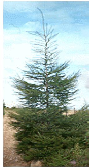
Japanese larch x tamarack?